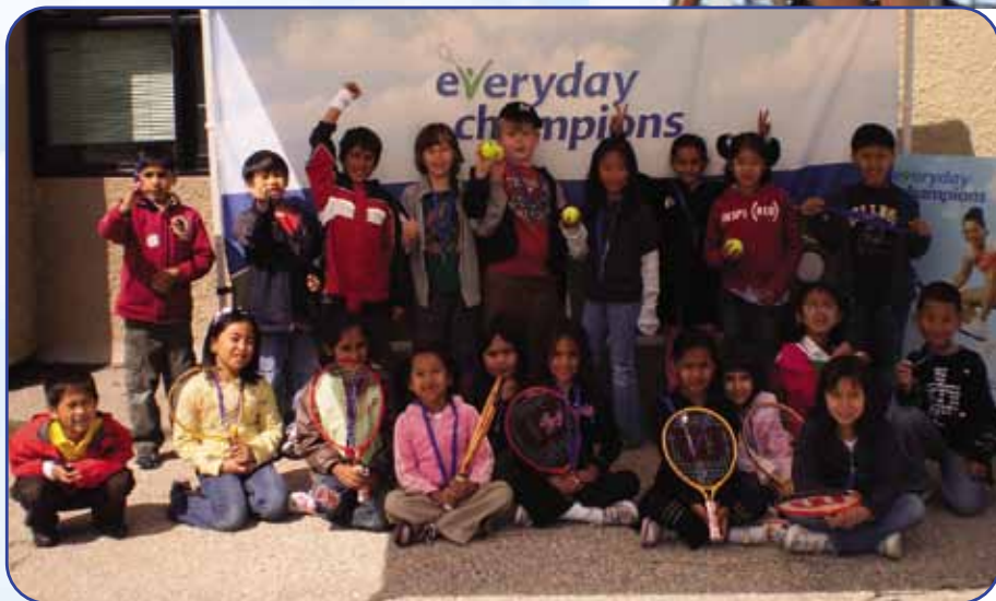
Winnipeg, MB, June 5, 2009